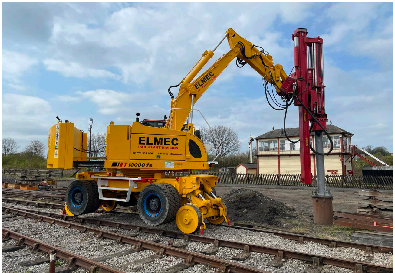
The Colmar T10000 pictured at Golden Vally Light Railway installing new CHS piles.